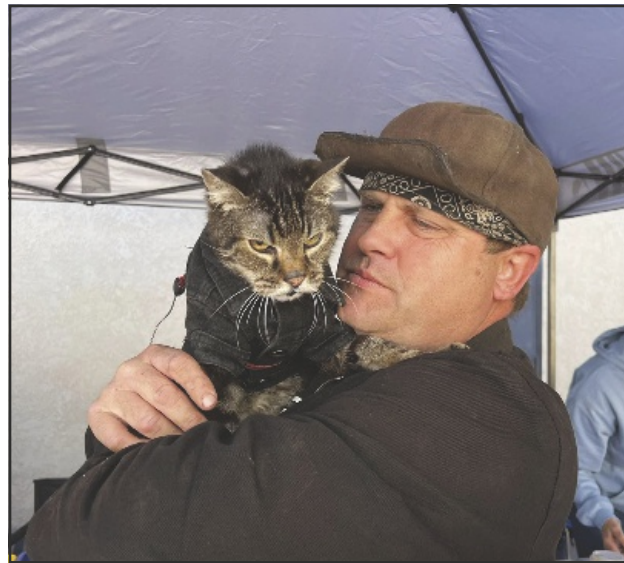
A patient and its human visits C.A.R.E.4Paws for vital pet services.

In fact, the clinic team will perform at least 3,300 surgeries this year, compared to about 3,000 in 2023. If a family cannot afford to pay for surgery or other treatment, the nonprofit does