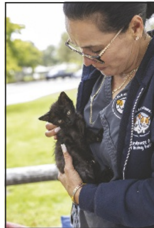
A four-legged patient is treated by a C.A.R.E.4Paws technician.

"Luckie is my trusted companion and, for us, C.A.R.E.4Paws is family," she said.